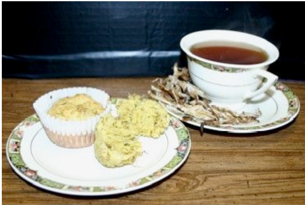
Dandelion Flower Muffins, Roasted Dandelion Roots, and Dandelion Root Coffee

Actually all parts of the plant are edible, but care must be taken to collect it in places where herbicides have not been used. One writer also reminds us of another danger for both wild and cultivated plants in areas of heavy traffic. "Horribly poisonous lead compounds came streaming out of every exhaust pipe, and, being heavy, settled thickly on surrounding vegetation. Some plants,