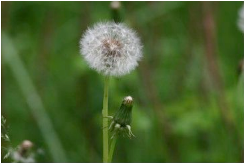
Seeds of Common Dandelion

itself in the ground. Flowers and seeds appear mainly in spring and early summer but also sometimes later in the season. The wind carries the seeds to many places that gardeners do not want them to grow.