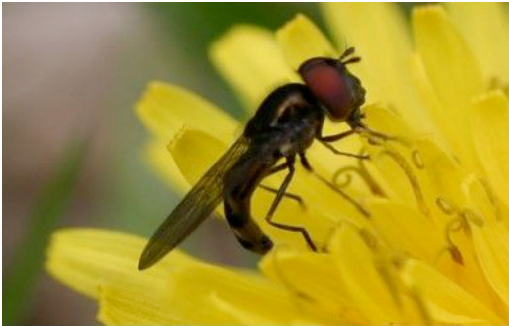
Insect on Dandelion Blossom

The individual flowers do not need to be pollinated to produce seeds. The flower stalk grows longer in preparation for dispersal of seeds. The bracts close around the flower and inside, each small flower produces a brown seed that grows from the female ovule. It is attached to a long stalk and silky parachute that can carry it to distant places. The seed has small barbs that can help it bury