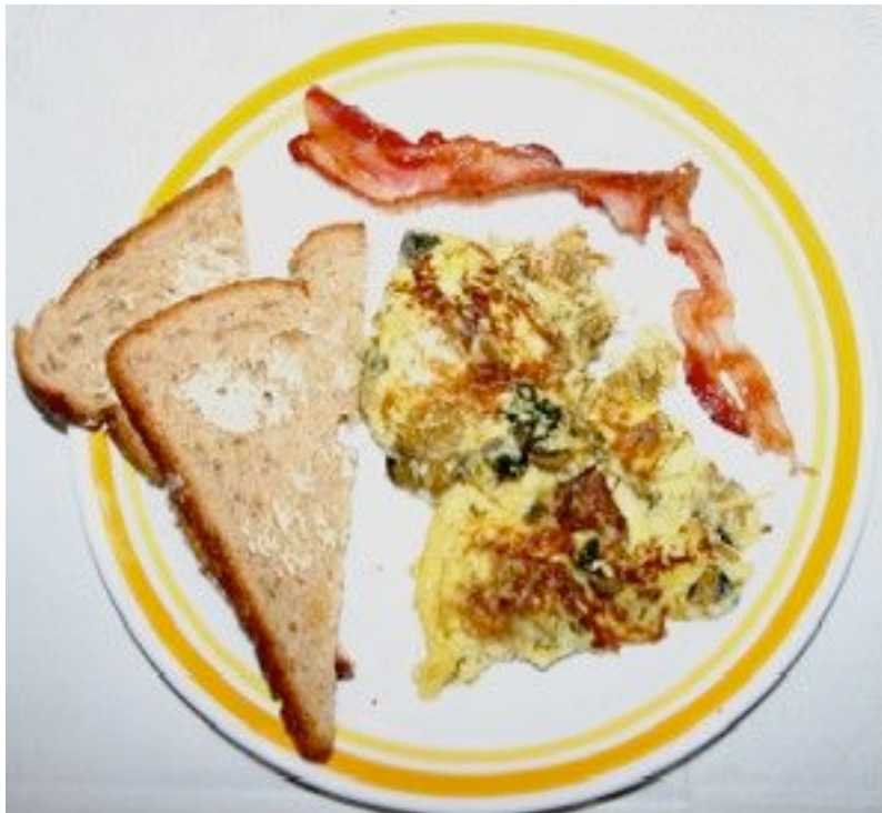
Scrambled Eggs With Dandelion Buds

The leaves are rich in more vitamins A and C, potassium, calcium, and iron than many of the vegetables we find in stores. If the leaves are gathered early before the blossoms appear, they will not have the bitter taste some people associate with wild foods. They can be used in salads or as greens on a bread and butter sandwich, or be prepared in a variety of ways as a cooked green. They make an excellent substitute for spinach in a wilted green recipe sautéed with bacon, vinegar and sugar. They can also be substituted for spinach in homemade green noodle recipes. One friend remembers a family tradition when each spring her mother and sisters gather for a meal of buttery mashed potatoes cooked with new dandelion greens. The tender white crowns can be stir fried or used in salads. The flower buds can be picked, cooked and creamed and eaten as a vegetable or included in omelets or scrambled eggs. The golden flowers with every trace of the green bracts removed can be cooked as a vegetable side dish, or used to make fritters or dandelion flower muffins.