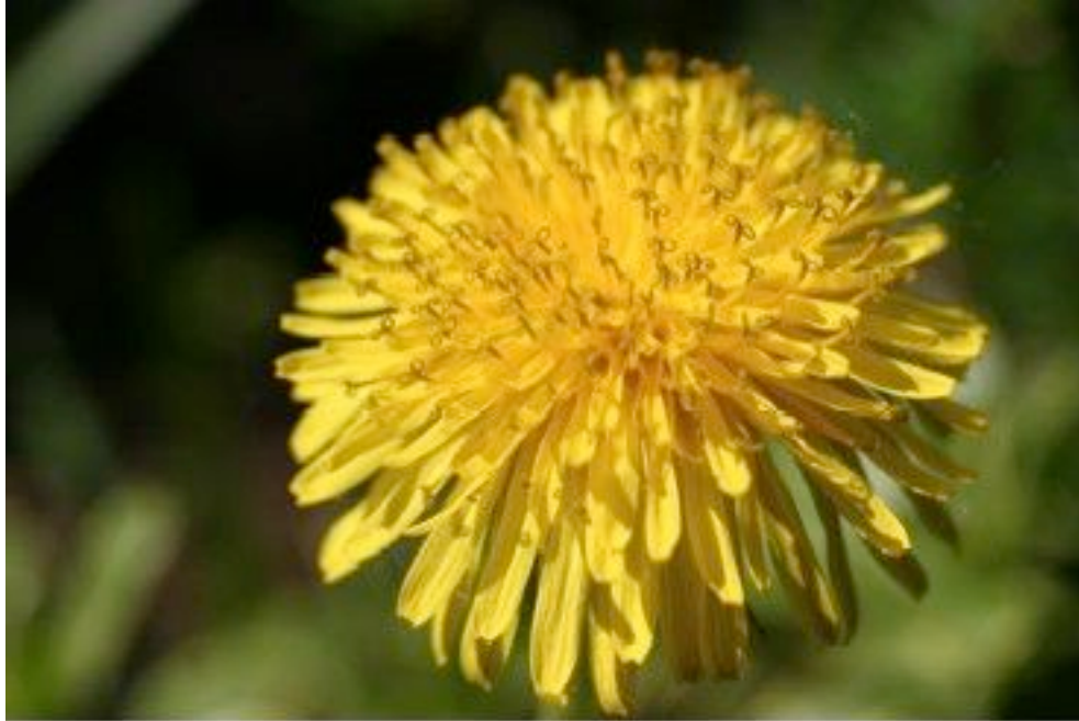
Common Dandelion Blossom