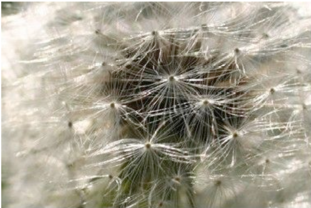
Close-up of Dandelion Seeds