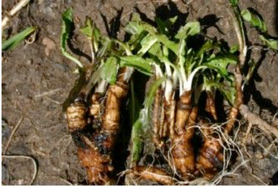
Roots of Dandelion Plants